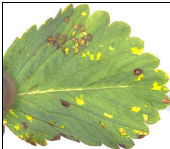
Fig. 3. Translucent spots of Angular Leaf Spot.