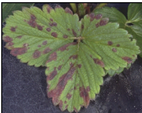
Fig. 2. Reddish-brown spots of Angular Leaf Spot.