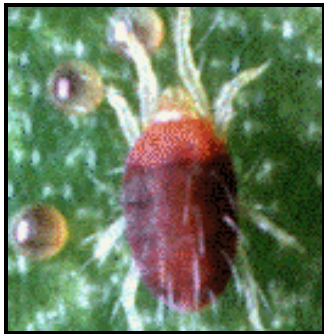
Fig. 1. Adult and egg stage of the tumid mite. The adult is a robust red mite (0.1 mm), with prominent hairs around the body which are visible with the aid of a 14X lens.

For more information visit http://strawberry.ifas.ufl.edu/entomology/spidermites.htm