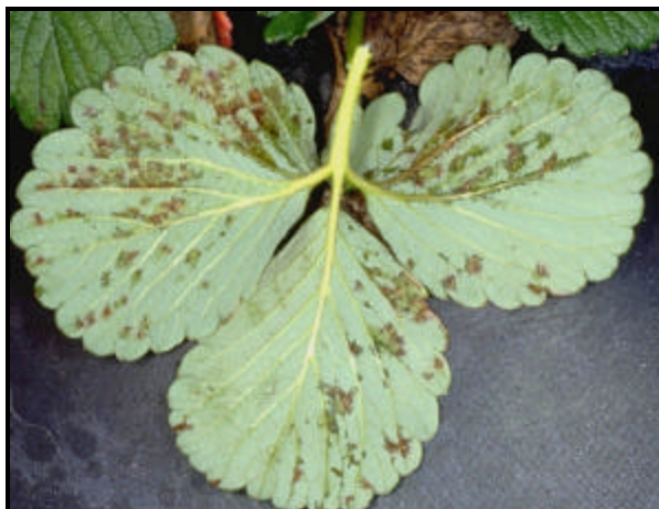
Fig. 1. Water soaked lesions of Angular Leaf Spot.