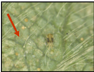
Fig. 2. The twospotted spider mite (0.07 mm length). Recognized by the two characteristic spots in the upper surface. Arrow shows the feeding damage on the leaf.